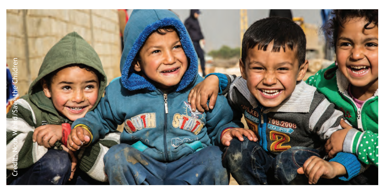
As soon as the sun comes up, Syrian children leave their tents in the refugee camp in the Bekaa valley, Lebanon, to play together