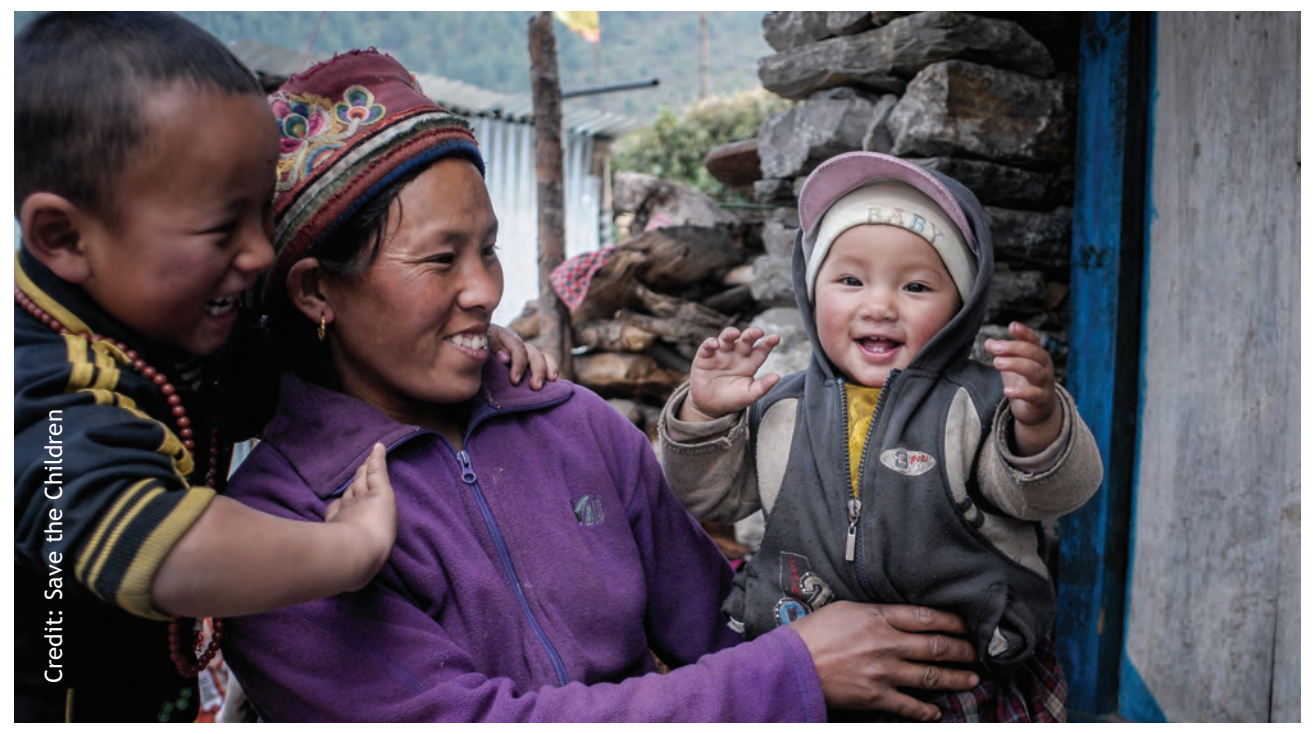
A family in Nepal

spend a high proportion of their incomes on food. restricting other spending and creating vulnerabilities to inflation and price shocks. Goods and services can be more expensive for poorer people because of the higher cost of provision (for example in rural areas, or insurance products where poorer people experience more risk) and a related lack of competition. Poorer people may also face higher costs where they need to buy goods in smaller units, over shorter timescales or using more expensive payment methods. Richer households both have more resources and can obtain a better deal in the market. 65 Extending access to affordable goods and services, including credit/financial services for the poorest families, provides a further strategy to support households with children.