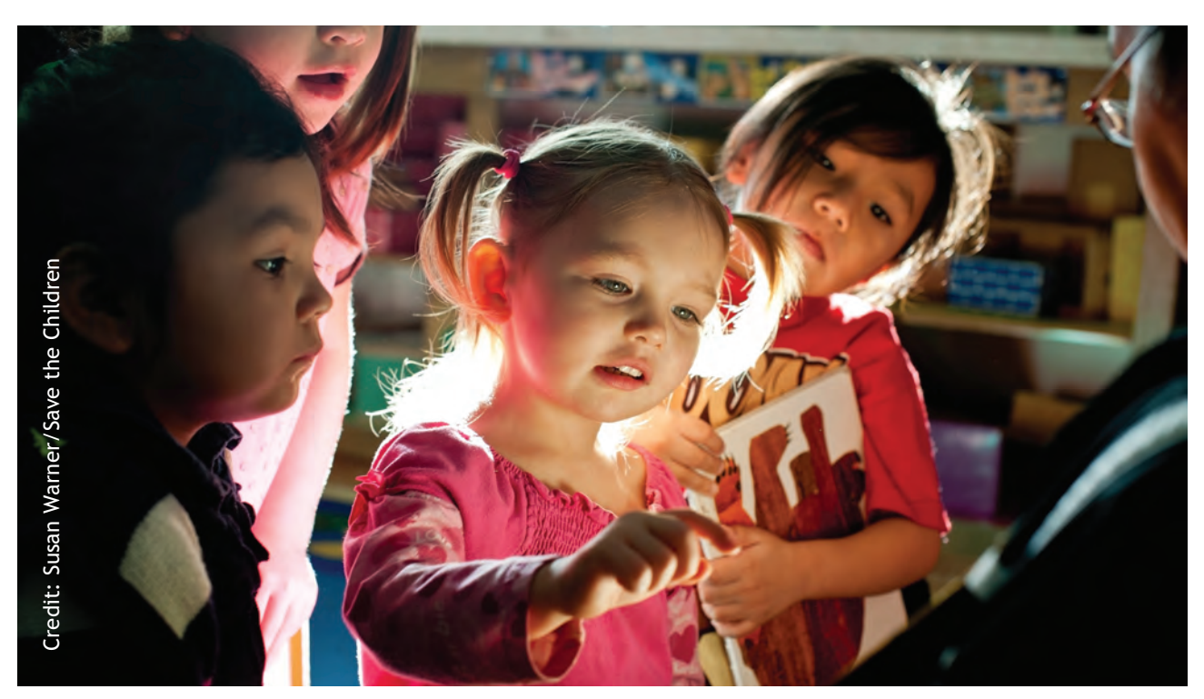
A three year old girl with her classmates and teacher in the US

The Millennium Development Goals promoted better access to key basic services. The Sustainable Development Goals go beyond this with a greater focus on outcomes such as learning. UNESCO argue that despite increasing enrolment in many low and middle income countries, there is a 'Global learning crisis'51 of 250 million children unable to read, write or count. In higher income countries it also remains the poorest children who are learning the least, though some countries do much better than others. 52 Poorer children are often behind other children in their learning even before they start school, highlighting the need to invest in the early years. Improving the quality of public services requires a focus where quality is worse, usually experienced by the poorest children and families. Interventions to improve classroom learningincluding whether teachers attend, are well trained or classrooms are equipped to support learning – is particularly important for poorer children. Rising enrolment in low and middle income countries also presents opportunities to consider the role of school for children's wider development with important opportunities such as school meals to support children's development as well as their attendance at school. 53