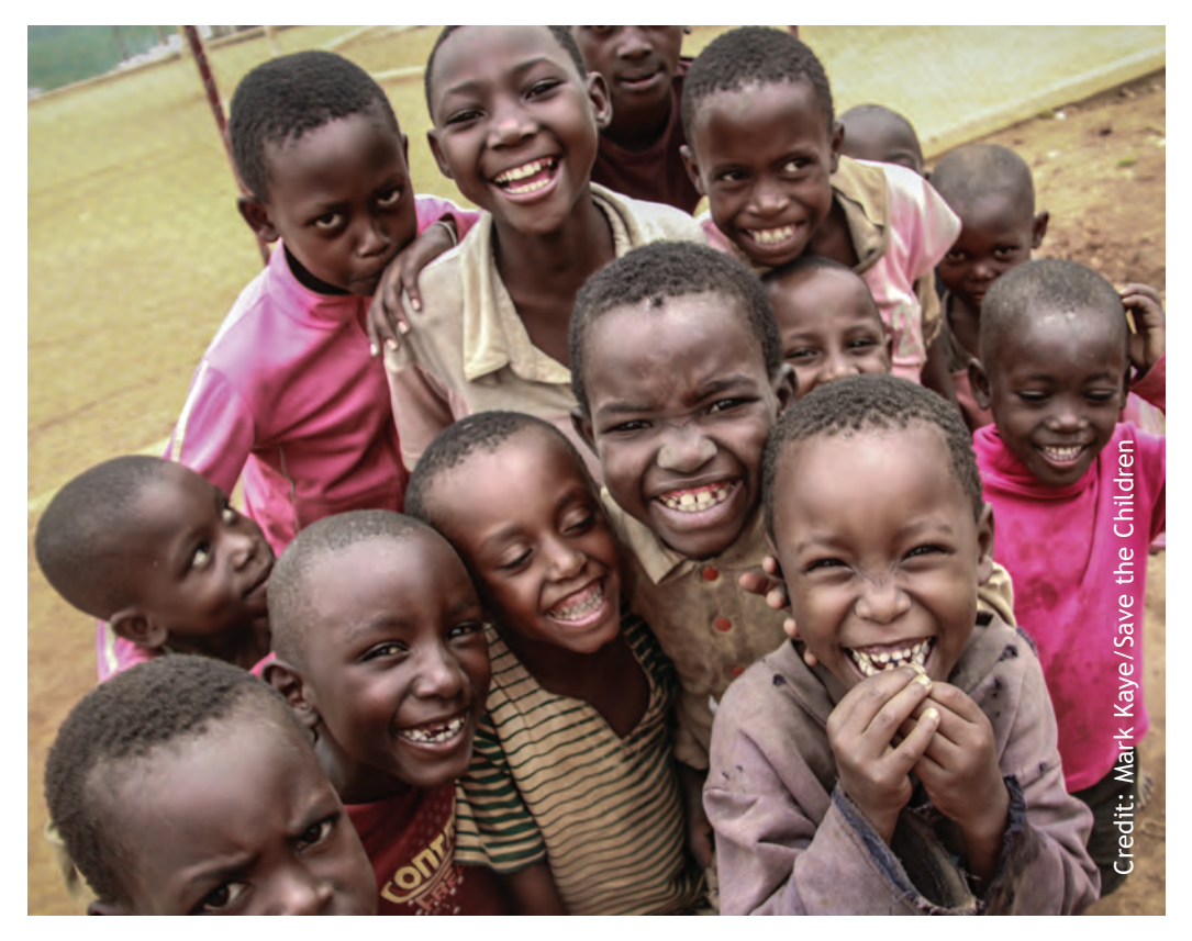
Children playing in Mahama Refugee Camp in Rwanda

Some countries, however, lack the capacity or the will to address the problems children living in poverty face. Ensuring stable state capacity and effective institutions is the fundamental solution, but childhood does not wait for the long term. Humanitarian agencies, supported by donors, alongside state institutions can help protect children in crisis. Interventions can include child-sensitive social protection, school feeding, as well as ensuring children have access to schooling and health care. Early intervention is important for children's development, alongside later investments to remediate early under-nutrition<sup>18</sup> and support to help children back into schooling.