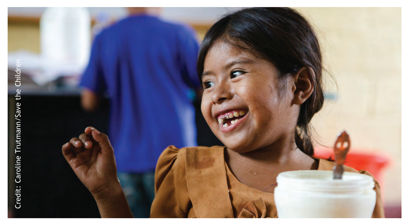
School girl at a school in Jocotan, Guatemala, receiving supplementary food after a severe drought destroyed her families crops in Eastern Guatemala

Whether or not to 'condition' receipt of cash transfers with requirements, such as the use of education or health services, is a question facing many social protection policy makers. A key mode of cash transfers, the conditional cash transfer has become popular throughout South America, and has spread to other countries. In this model, payments are made to families with children conditional on the use of services such as education, health clinics or child nutrition. Other instruments, such as family allowances and benefits in OECD countries, and the Child Support Grant in South Africa tend to be less conditional on specific behaviour. The World Bank has argued the conditional cash transfer model reduces current poverty and encourages human capital development through the use of services. 28 Sceptics argue that imposing such conditions are paternalistic, assuming families do not use services because of ignorance rather than other barriers and in doing so reinforces the myth of the 'undeserving poor.'29 Conditionality also requires record keeping and also that adequate services will exist for families to access. Importantly there is positive impact evaluation evidence both from schemes that include behavioural conditionality<sup>30</sup> and those that do not.31 Extending access to social protection per se, and the level and the regularity of the payment, will be particularly important for impacts on children's wellbeing, not conditionality alone.